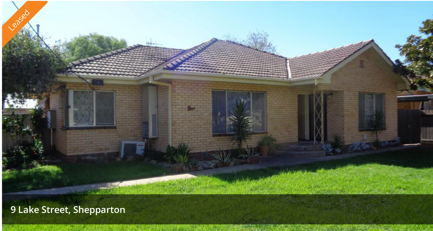
9 Lake Street, Shepparton