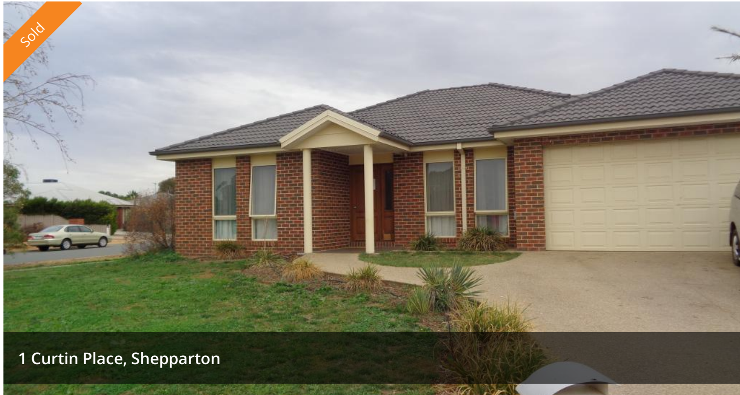
1 Curtin Place, Shepparton