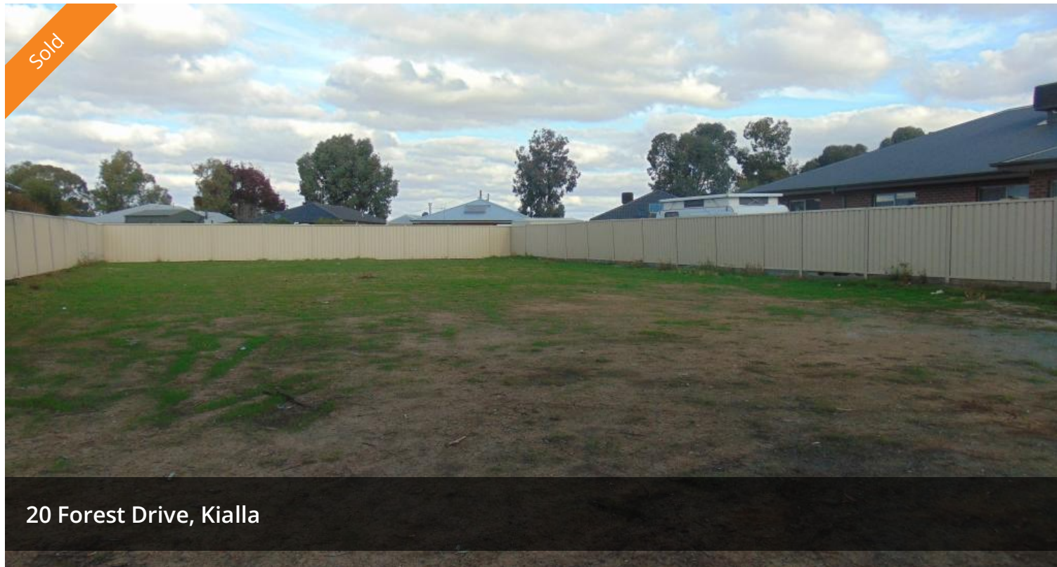
20 Forest Drive, Kialla