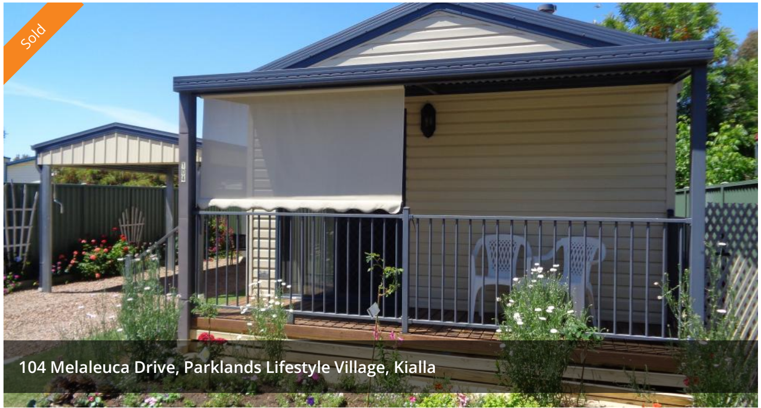
104 Melaleuca Drive, Parklands Lifestyle Village, Kialla