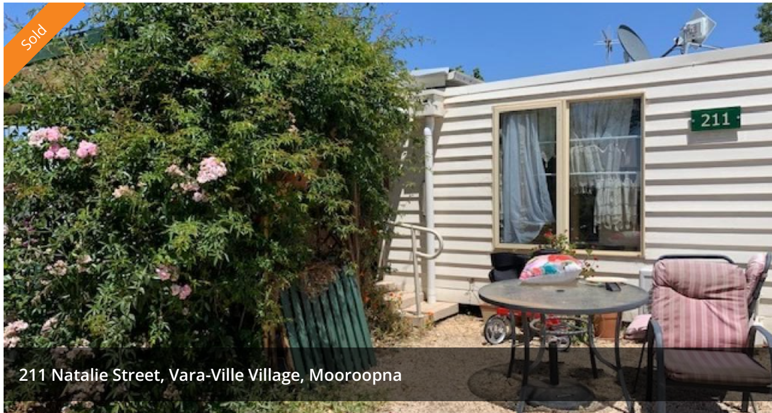
211 Natalie Street, Vara-Ville Village, Mooroopna