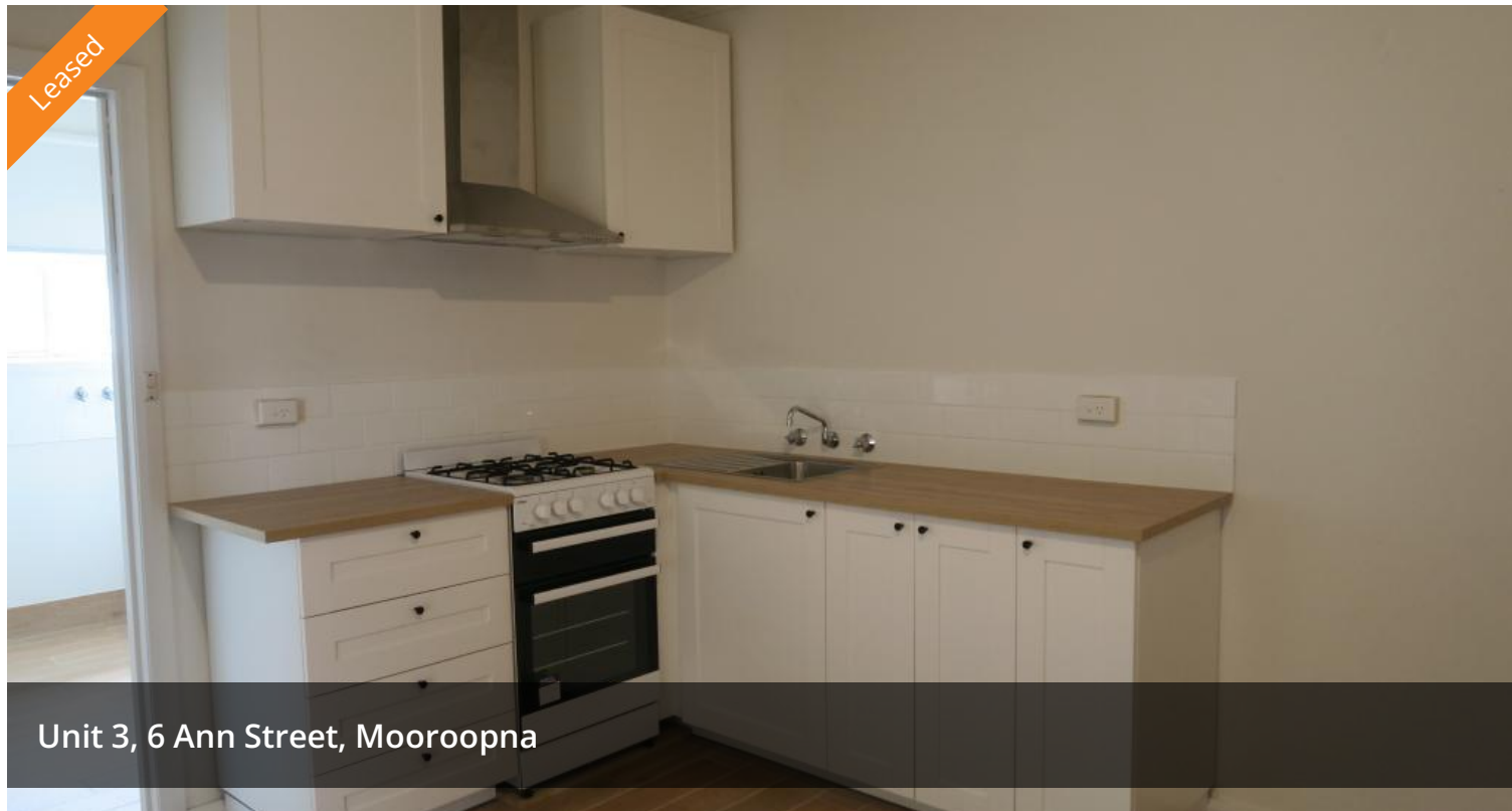
Unit 3, 6 Ann Street, Mooroopna