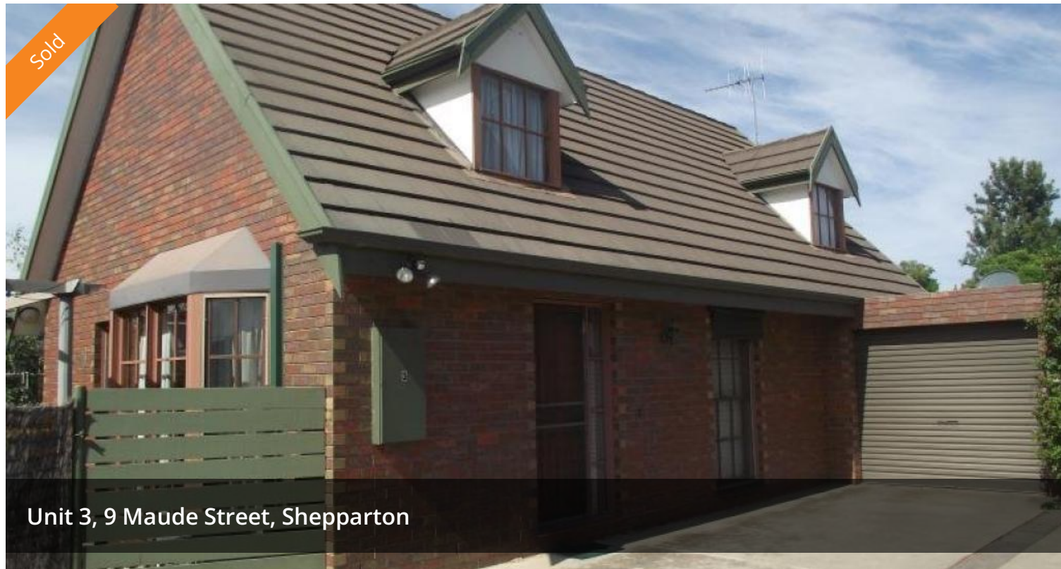
Unit 3, 9 Maude Street, Shepparton