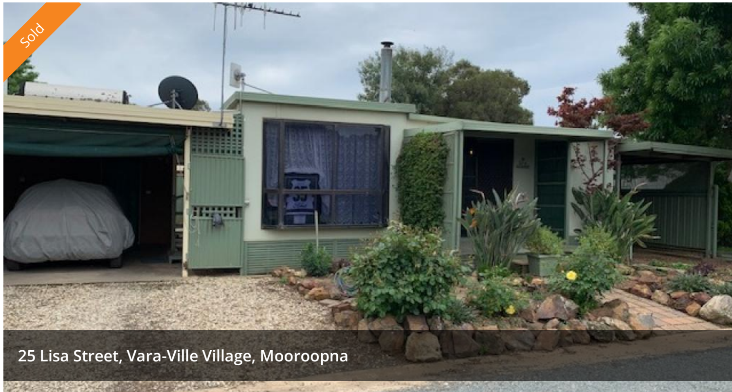
25 Lisa Street, Vara-Ville Village, Mooroopna