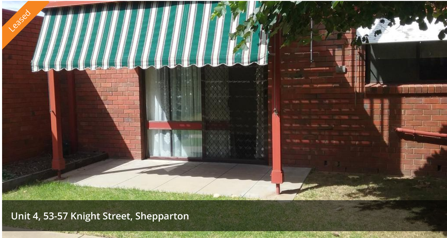
Unit 4, 53-57 Knight Street, Shepparton